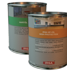
IRSA Nature Line Oils & Waxes