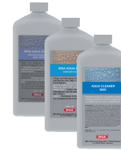
IRSA Care Maintenance & Cleaning