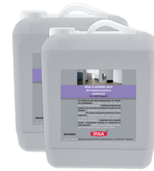
IRSA Platinum Water-based varnish

Due to the additional weight included in the scope of supply, the sanding pressure can be individually adjusted so that the very best sanded surface can be achieved. Hence the parquet flooring sanding machine IRSA ESM 406 can also be utilized for difficult flooring. The adjustable handle makes it possible to adjust the one disc sanding machine to suit the height of the person using it and the integrated safety switch prevents the machine from being switched on accidentally.