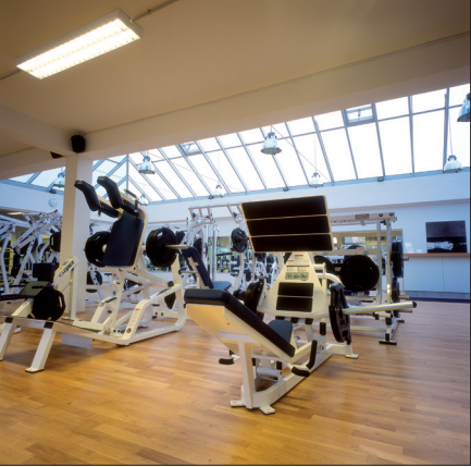
IRSA Wood Seal in the Lady-Fitness Centre, Berlin

Valuable tips on this subject can be gained from our care instructions for sealed flooring.